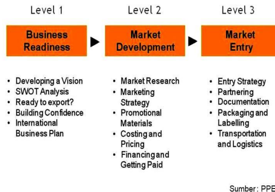
Figure 2 Export Competence Area

Curriculum of The Export Coaching Program since 2010 has improved several times. During the revision period last year, the new curriculum program was completed 4 times. In the first year of the implementation program, the Canadian Trade Facilitation Organization (TFO) as IETC's collaborative partner in implementing the Export Coaching Program provides this program for 3 people who must be supported by participants for one year, figure 2 as follows: