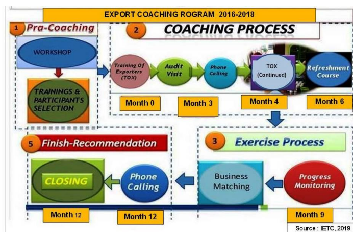
Figure 4 Step to Export Coaching Program 2016-2018

In accordance with this curriculum, the implementation of the Export Coaching Program for 12 months is classified into 3 stages, namely 1) Pre Coaching which consists of Workshop and participant selection; 2) Coaching Process, which consists of Training of Exporters, Audit Visit, phone calling, Advanced TOX and Refreshment Course. The third stage is the exercise process, namely Progress monitoring and Business Matching. The final stage is Finish-Recommendation, which consists of Phone Calling and Closing. In the Closing Event a grading system was introduced, namely the classification of participant performance after attending the Export Assistance Program.