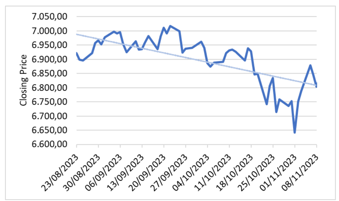
Figure 1 IHSG Fluctuation

The movement of the Index Harga Saham Gabungan (IHSG) on the announcement of the president and vice-president nominees of Indonesia from August to October 2023 continued to fluctuate. The IHSG fluctuation remained stable at the announcement period of Anies-Muhaimin at the end of August 2023. However, the announcement period of Ganjar-Mahfud and Prabowo-Gibran in October 2023 caused the IHSG movement to tend to decline (see Figure 1.). The IHSG fluctuation is the overview of the capital market when an event or announcement occurs (Binder, 1998). In general, IHSG will move in a positive direction if there are presidential nominees and vice presidents considered to be market favorites. As in Jogiyanto (2019), during the presidential election in 2014, the couple Joko Widodo and Jusuf Kalla can be said to be the market favorites, evidenced by the fact that IHSG tended to move up on the event. Looking at the IHSG fluctuation in Figure 1., it is hard to be sure that no couple of Indonesian presidential and vice-presidential nominees in 2023 are the market favorites. However, what is certain is that the IHSG fluctuation reflects how the market responds to this event. The nature of five-year political events, such as the announcement of the president and vice-president nominees of Indonesia in 2023, is interesting to study further the reaction of the capital market.