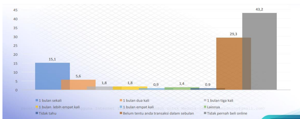
Figure 1. Infographics of Survey Results on Monthly Online Purchase Intensity Source: Indonesian Internet Service Provider Association Survey Report from 2019-2020

This phenomenon occurs in consumer behavior. As a business owner, it is essential to adapt to technological advances to correctly answer the demands of its consumers and run their business according to trends. In marketing, technology plays a critical role in marketing activities. Technology-based marketing can effectively strengthen the company’s image and increase its existence in its target market. Advances in technology provide wider opportunities for businesspeople to maximize marketing strategies with the ultimate goal of getting profit for the company.