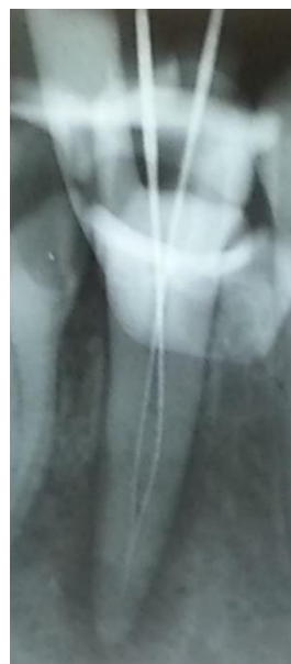
Figure 4. #35 Working length