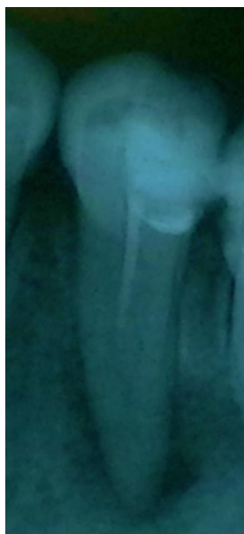
Figure 3. #35 post inadequate RCT