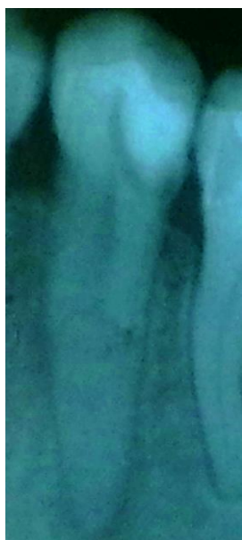
Figure 2. #35 post pulp capping (preoperative 1)