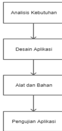
Figure 2.1 Development Method

Figure 2.1 depicts the application development in this study, described as follows.