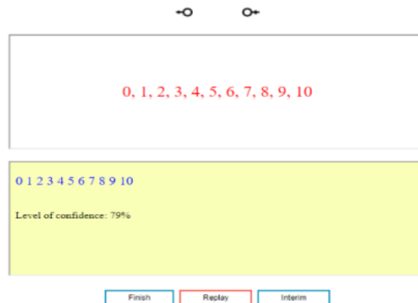
Figure 2 Practice Result

After logging in with the previously registered account on the desktop application, the users could select the content they wished to study. After determining the topic to be studied, the application allowed the immediate download of the necessary materials. Figure 1 represents one of the desktop application's displays. This page contained fundamental content, particularly the pronunciation material of numbers. The image of this pronunciation material included a help button displaying directions for beginning the activity. In addition, there was also a practice button to begin the practice session, and a confirm button to view the practice session's results.