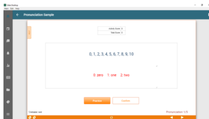
Figure 1 Pronunciation Material

After undergoing evaluation and testing, the results of the application display are exhibited in Figure 1.