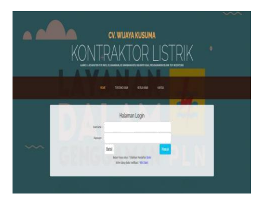
Figure 3 Login Page

Figure 3 depicts the login page display where users should enter their usernames and passwords to access the application.