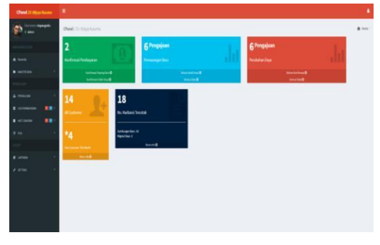
Figure 6 Administrator Main Page Display

Figure 6 demonstrates the main page display of administrators after logging in.