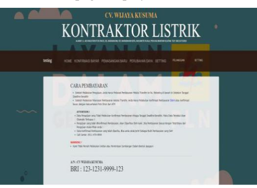
Figure 5 Customer Main Page

Upon logging in, the customers were taken to the page serving as the main page. Figure 5 depicts the customer main page display.