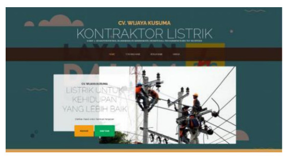
Figure 2 Homepage

Figure 2 portrays the homepage where users (customers and administrators) opened the web address.