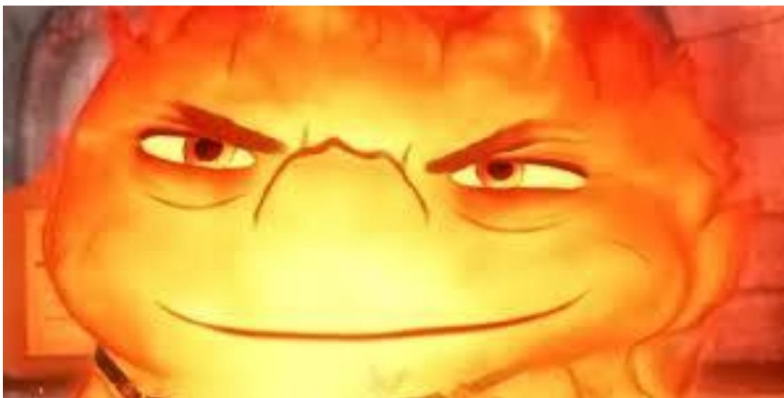
Figure 3. Bernie Lumen, Ember's father (Friska, 2023)

Bernie Lumen is a figure who plays an essential role in the Ember Lumen family at Elemental. As a famous father and shop owner, Bernie was stern, wise, and dedicated. As a figure respected by many people in his town, Bernie is an example for Ember in living life and running a shop. He always supports and motivates Ember, encouraging her to develop her potential and face challenges bravely. Bernie intends to retire and hand over his shop to Ember Lumen. However, when he finds out that Ember still has trouble controlling her emotions, Bernie decides to continue running the shop to keep everyone safe.