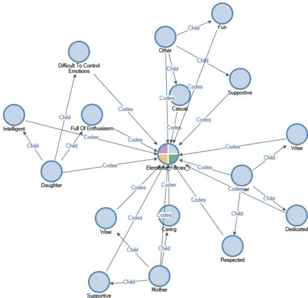
Figure 6. Relationship Between Nodes

The relations between nodes of characters in the Elemental movie are displayed in Figure 6.