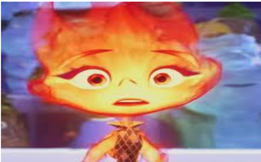
Figure 5. Ember Lumen (Pramesti, 2023)

The film Elemental tells the story of creatures that represent natural elements in human life, such as water, fire, air, and earth. These elemental creatures reside in a city called Elemental City. The movie also depicts a forbidden love story between two main characters who possess different elemental powers: water and fire. The young couple, with their clashing elements, faces challenges in their pursuit of love and unity. Their story begins with a family of fire elemental creatures named Bernie and Cinder, who migrate to Elemental City. During this time, Cinder is pregnant with their only daughter, Ember Lumen. Due to their unique physical characteristics, they struggle to find a place to live among the other elemental creatures (Lestari, 2023).