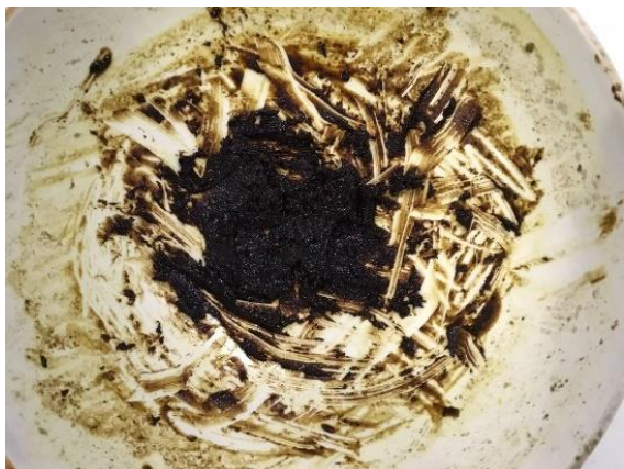
Figure 1. Ethanol extract of garlic peel

Maceration is an applicable, simple extraction method commonly used in large and small pharmaceutical industries. The extraction yield obtained was 3.8%. The resulting extract was thick, yellowish brown in color, with a distinctive aroma of garlic (Figure 1).