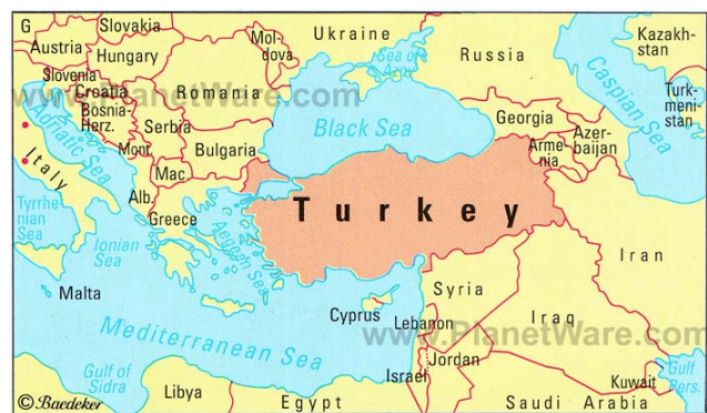
Figure 1. Republic of Turkey and its Neighbours.

Hudson and Vore mentioned some of the inclusive factors were involved for decision makers consideration in foreign policy including culture, history, geography, economy, political institutions, ideology, demographics, and innumerable other factors in a societal context (Hudson and Vore: 1995).