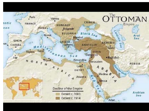
Figure 2. The Ottoman Empire in 1683 and 1914.