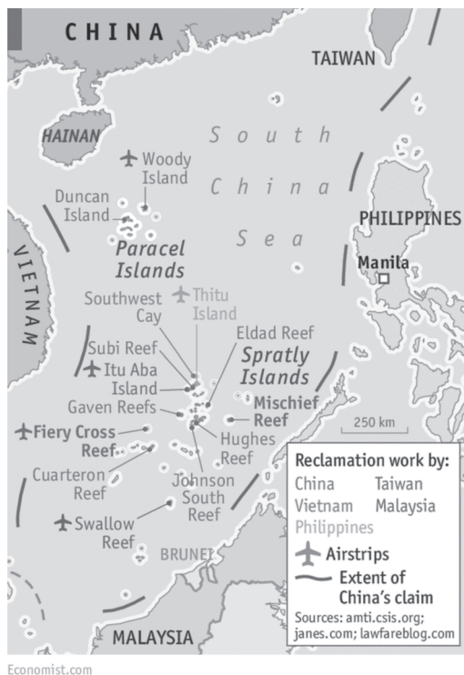
Figure 2. Map of disputed area in the South China Sea

different levels; maintaining neutrality which will therefore carry consequences to promote peace among the global power projections and pursuing national interests which requires strategic attempts. Finally, minimizing conflict and increasing the potential opportunities through regional based cooperations would be the prominent goals to achieve on this basis.