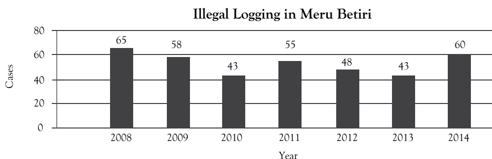
Figure 2. Number of illegal logging cases in MBNP 2008-2014 (MBNP, 2014)

Although not directly related to community participation in REDD+, rampant illegal logging and weak law enforcement became major challenges to the success of community participation. Illegal logging activities happened in conservation areas, while weak law enforcement caused many illegal loggers to take advantage of the forest area for the long term. It was also associated with the limited number of forest rangers in MBNP. The participation of local communities in REDD+ did not reduce illegal logging cases significantly. In 2014, the number of illegal logging cases in MBNP