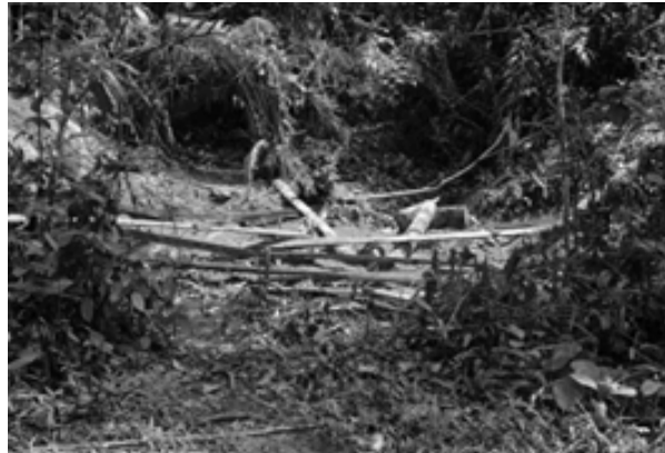
Figure 3. Illegal Logging in the MBNP area (author's work)

have local knowledge, but some communities have cultures to explore the forests since the previous generation. It causes environmental awareness varies from one community to another.