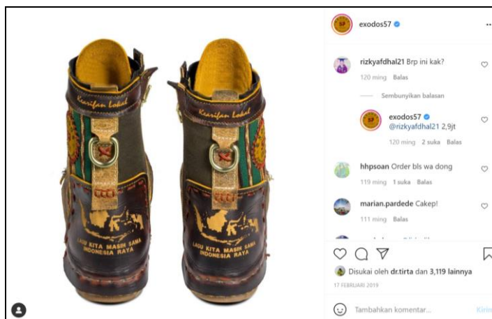
Figure 3. Shoes with Indonesian Map

The shoe series that gave rise to the map of Indonesia was immediately sold out when it was exhibited at the Custom Collaboration event in 2018. Only one pair was left for display or display. This shoe manufacturer stated the uniqueness of this type of shoe because they can combine canvas, leather, and traditional Indonesian weaving. An additional feature is that the pattern of the woven fabric in each pair of shoes is made differently. So, no shoe in this series is the same. On the back of the shoe, on the heel, you can see a map of Indonesia drawn using a laser. Once again, according to the producer’s acknowledgment, this product was created as a form of their love for local Indonesian products and their pride as a child of the nation (Wisnubrata, 2018).