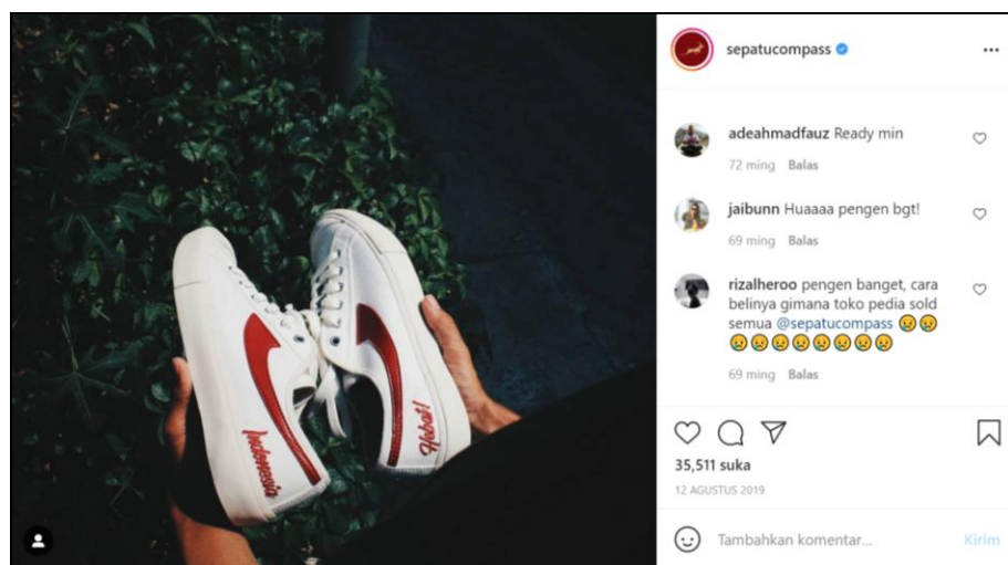
Figure 5. Compass Sneakers Indonesia Series with White Colour

Figure 5 is an image of sneakers with a white base color. The shoe brand symbol is red. The use of red and white colors can remind users of the colors of the Indonesian flag. The words “Indonesia Hebat” appear on the product. This slogan was written in support of the implementation of the Asian Games in Indonesia. The moment of launching sneakers was also released ahead of Indonesia’s Independence Day, which is on August 17.