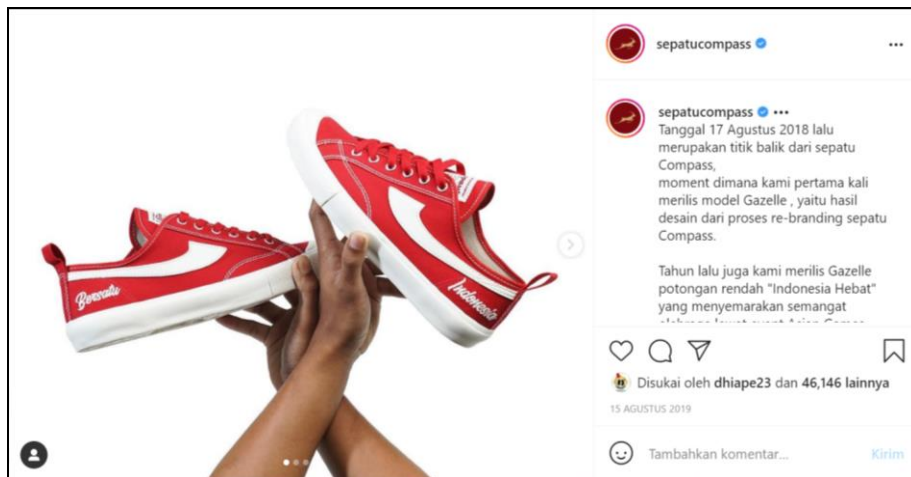
Figure 4. Compass Sneakers Indonesia Series with Red Colour

Figure 5 is an image of sneakers with a white base color. The shoe brand symbol is red. The use of red and white colors can remind users of the colors of the Indonesian flag. The words “Indonesia Hebat” appear on the product. This slogan was written in support of the implementation of the Asian Games in Indonesia. The moment of launching sneakers was also released ahead of Indonesia’s Independence Day, which is on August 17.