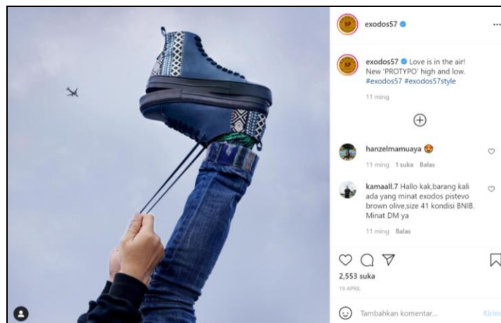
Figure 2. ‘Tenun’ Sneakers

Figure 2 shows the remediation between magazine photo formats and space adjustments on Instagram. This upload informs followers of a product from the Exodus57 brand called Protypo. The format used in this upload is the rebus format, where the image and text are integrated into the design. The unification of images with writing forms a storyline (Sansom, 2016). The visuals have shown shoe products, with the shoe material taking woven fabric as its character. Woven fabric is a typical Indonesian fabric. Indonesia has a variety of woven fabrics from Sumatra, Kalimantan, Java, and Nusa Tenggara (IBM, 2022; Indra, 2017).