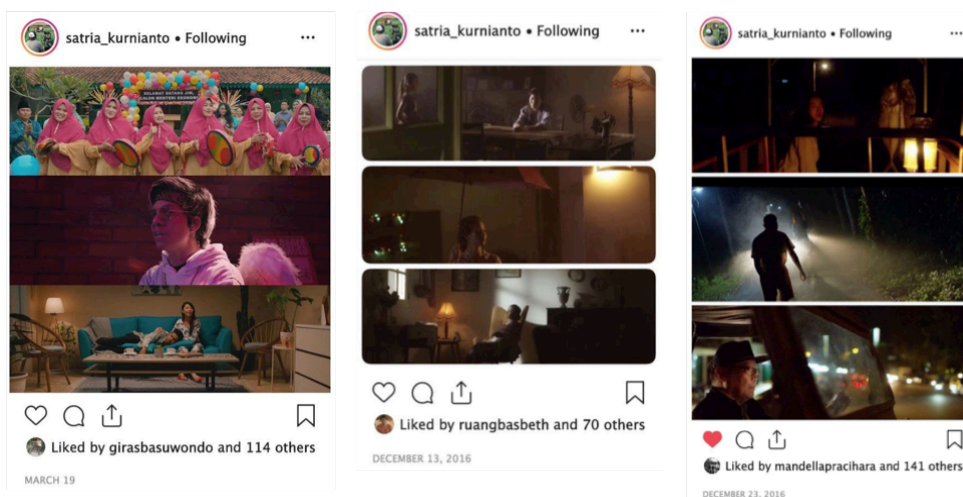
Figure 2. Shot trailers

Design is vital in this case since lighting sources could give unique motivation towards shooting sessions, as well as the efficiency and the effects. Crews in the camera department will serve in the form of provision and equipment arrangements needed during the production time as DP's instruction. In this process, DP is posted as the leader of the camera department while providing entertainment facilities to enhance the crew's motivation. Collective works between DP and the teams in the camera department in realizing pictures as visual concepts thought by the director can be seen as a process of symbolic interaction.