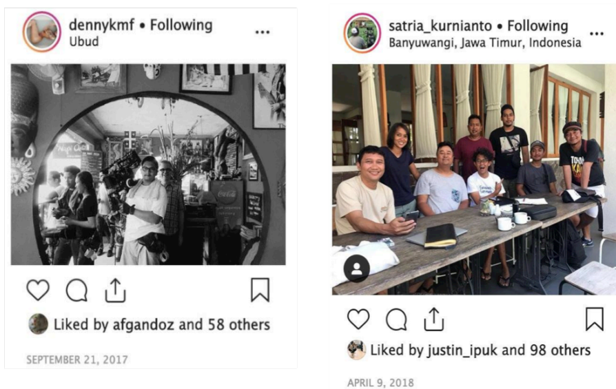
Figure 4. DP with the Film Production Teams

DC uploaded pictures when producing movies with expatriates. It can be seen as symbolic interaction, meaning that he works in the international environment and creates works for international consumption. English caption to explain the pictures strengthened symbolic interaction that is established between DC and broader society. DC's circumstances that involved many foreign investors contributed to his working culture. Balinese film crews have different work cultures from other film crews in other regions. As stated by Caldwell “Film/television production communities themselves are cultural expression and entities involving all of the symbols processes and collective practices that other use: to gain and reinforce identity, to forge consensus and order, to perpetuate themselves and their interest, and to interpret the media as audience members”(Caldwell, 2008,2). It is in line with the researcher’s argument that each film worker triggers the working culture itself. Observation during working is made to understand symbolic interaction patterns. A statement also justifies that culture affects work organizing, notably in the creative industry (Smith and McKenlay, 2009, 12).