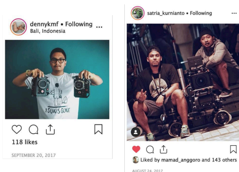
Figure 3. DPs with their film production equipment

Visual recording equipment, or only a camera, is crucial equipment in production. Capable of operating it with the standard operation procedure ( SOP ) is a skill that should be mastered by a DP. Insight on the advantages and disadvantages of equipment used becomes vital to make a picture in line with the script and the director's imagination. Through taking selfies with the latest series of cameras, DP interacts symbolically with the director, producer, society, and also producer of film production equipment. It can be interpreted as a symbol that he could operate the most current facility to realize the director's imagination on a script. It is, therefore, also a symbol for the producer that the DP could use the latest camera. It is a sign that the DP is the type of person that always tries to improve the quality so that deserving higher pay. Through review toward the latest camera he writes, DP interacts symbolically with the society and camera producers. For society, it implies that he is an expert that can be a reference, and, for the factory, the DP is a person that is representative to be the brand ambassador of the product.