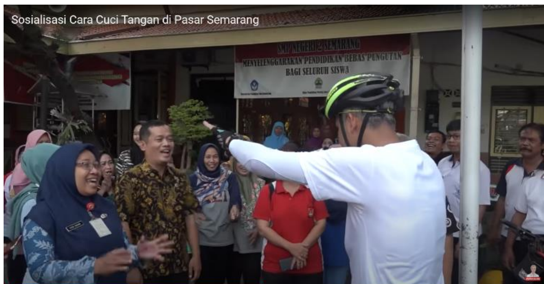
Figure 2. The Governor reminds teachers to keep physical distance by not standing close to each other

The credibility of the communicator who is considered to be very good shows that the majority of respondents tend to process persuasion messages (health protocol education) through the peripheral route. Another cue that supports the processing of persuasion messages on this route is the Governor’s ability to arouse audience emotions ( pathos ). Table 1 reveals that the respondent’s assessment of the Icing Device Persuasion Method indicator reached 60 percent. Icing Device Persuasion Method is an approach in which extension content is delivered using words that can bind the audience’s emotional, such as making them happy, happy, sad, or impressed. In the video “Socialization of Hand Washing Methods in the Semarang Market”, it appears that Governor Ganjar Pranowo does not hesitate to make jokes when delivering health protocol education in front of the public and laughing together. This method is considered to be effective in eliminating the impression of “distance” between regional leaders and citizens, so that the audience participates in counseling and processes persuasion messages in a fun, without any awkward impression. For example, the Governor reminded teachers to keep physical distance when counseling was taking place. “Come on, you can’t go near. At least one meter”.