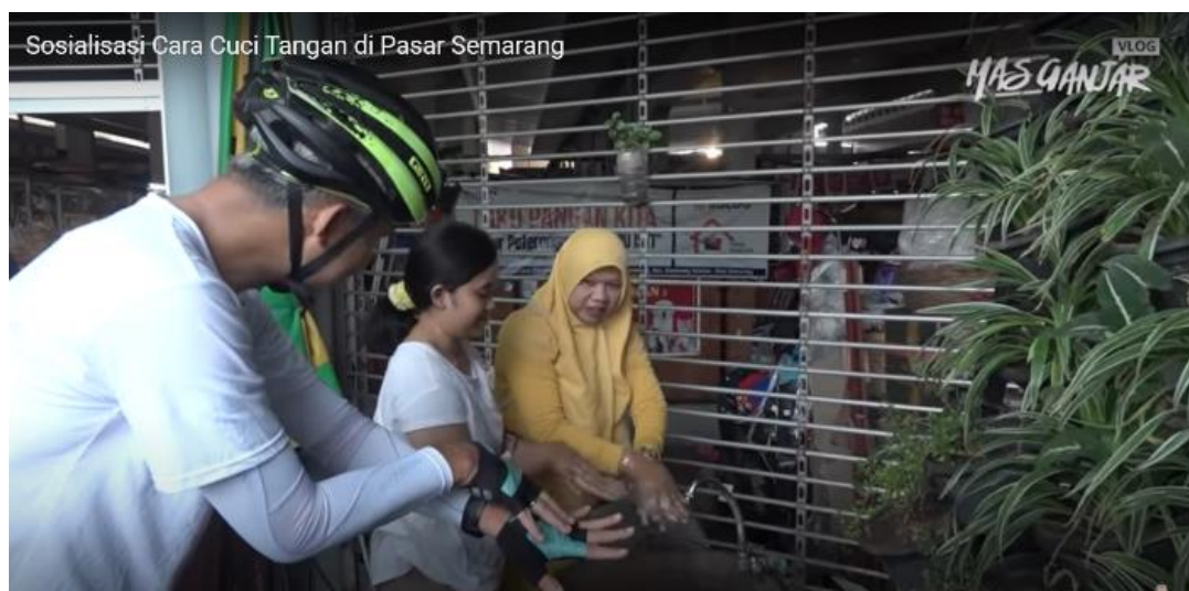
Figure 1. The Governor educates buyers who are about to enter the market on proper hand washing steps

The research findings show that the majority of respondents think that the Governor of Central Java, Ganjar Pranowo, is a credible communicator. This is in terms of intelligence ( phronesis ) the Governor in delivering education about health protocols during the COVID-19 pandemic. The Governor immediately practiced how to take proper handwashing steps when having dialogues with a number of mothers, then asked them to imitate. The education is also delivered in a language that is easy to understand, in accordance with the characteristics of the target group. The Governor also appealed to cleaners to ensure every visitor to wash their hands in the places that have been provided, both when entering and leaving the market.