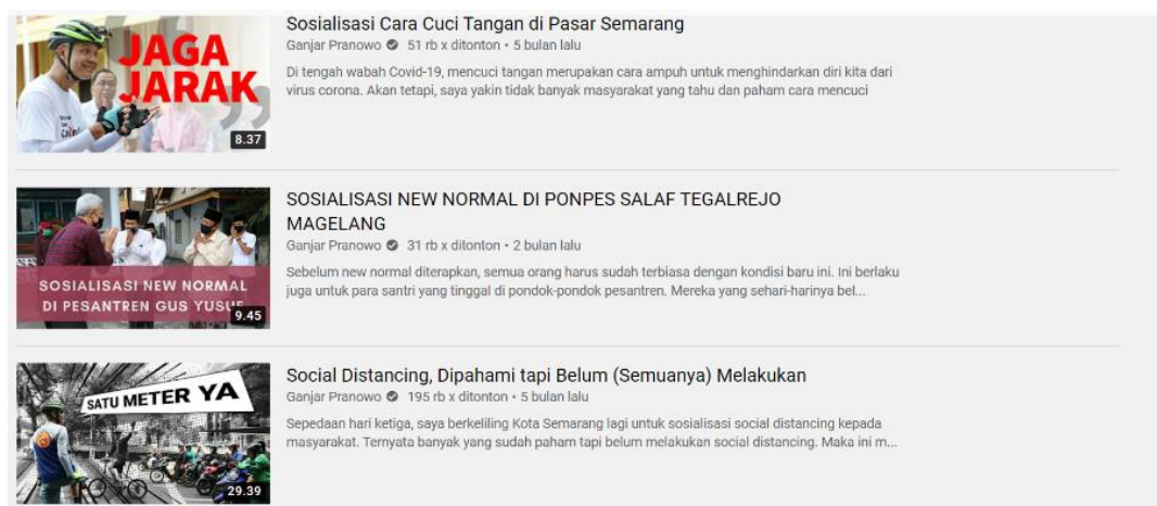
Figure 4. Display of educational videos about COVID-19 Governor Ganjar Pranowo containing visual text, images, and music audio modalities

Social media has grown into a necessity for political campaigns (Vonderschmitt, 2012). Through Facebook, Twitter, and YouTube, candidates can build relationships with their constituents to encourage participation in their campaigns. When conducting persuasion in political campaigns, several things that must be considered are candidates as communicators who convey the message, the symbols and words used, and the context of the message (Newman and Perloff 2004, 30-2). Candidates or communicators must demonstrate integrity and competence to appear credible to constituents (Newman and Perloff 2004, 27). This can be supported through appearance and emotionalism. Emotionalism allows candidates to express themselves and establish relationships with the public (Lilleker 2006, 78). YouTube allows netizens to rank videos by providing likes and dislikes and showing the number of times a video has been watched. This attracts more viewers to watch the video. Not only can YouTube be used to post campaign ads, but it is also useful for posting video blogs that form a candidate’s campaign trail.