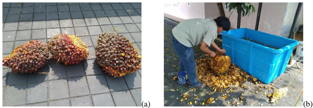
Figure 1. EFB pre-treatment process: (a) Palm fresh fruit bunches (FFB); (b) the process of separating the fruit from the FFB before soaking (water retting)

The processing of oil palm empty fruit bunches (OPEFB) into alkali cellulose is carried out physically and chemically. The pre-treatment steps, namely mechanical cleaning and peeling, water retting, and drying, are carried out until dry EFB fibers are formed with a water content < 20%. The oil palm EFB used in the research was the whole EFB, without separating the stalk and spikelet components. These pre-treatment steps still rely heavily on human power and natural drying using sunlight, as shown in Figure 1. There are several obstacles in the pre-treatment stage. Soaking the large EFB fibers takes a long time due to their size, further complicated by cloudy and unpredictable weather that extends the drying time to more than 6 days.