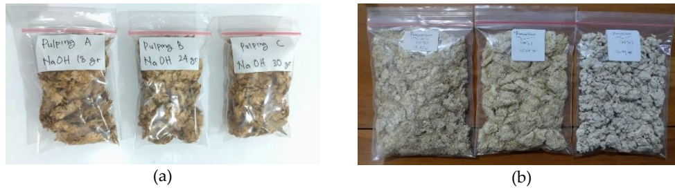
Figure 2. Dissolving pulp production: (a) sample after pulping process; (b) sample after the bleaching process