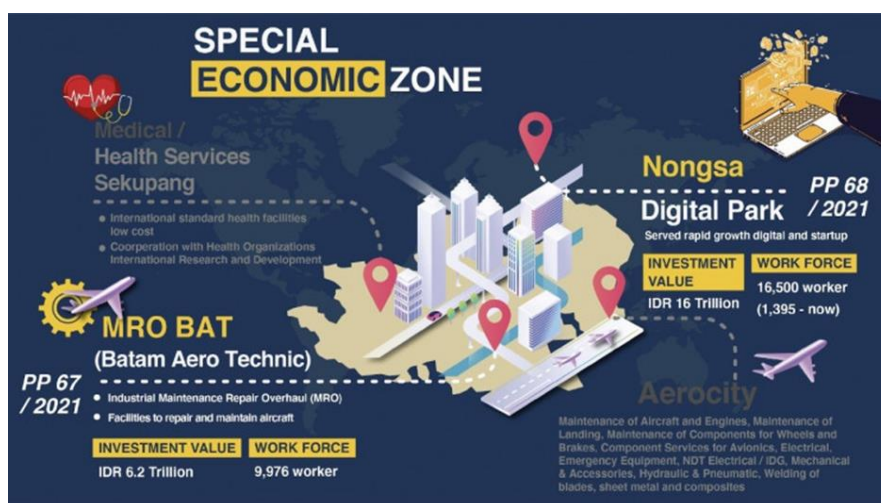
Figure 3. Special Economic Zone Development Plan in Batam City