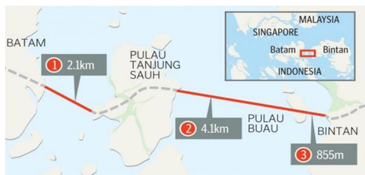
Figure 2. Geographical Location of Batam-Bintan Bridge Construction

On the other hand, in the neighborhood first, Indonesia's closest neighbors are Malaysia and Brunei Darussalam because it is easier to see from the concentric circles where the contents are ASEAN members. Therefore, Indonesia has various modalities needed to increase cooperation and other countries.