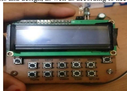
Fig. 2. Tool Display

After the implementation stage is carried out, it is followed by the testing phase (Figure 2). The testing phase is carried out to determine the suitability between the results of the implementation and the predetermined needs analysis. Blackbox testing is carried out to find out whether the system built has been running in accordance with the results of analysis and design, as well as according to needs.