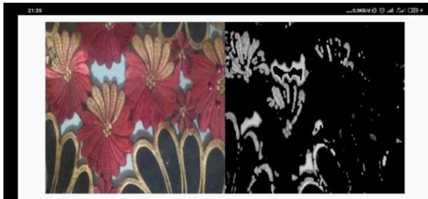
Fig. 4. Display of Current Processes

To detect infrared light based on the color of the video file, image processing is needed. Where the image input in the image processing process in this system is obtained from the image taking or image acquisition process whose output is an image that has an RGB value.