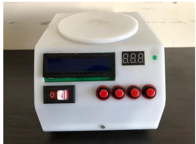
Fig. 2. Microcontroller Based Magnetic Stirrer

The manufacture of this tool uses a microcontroller to adjust the timer that works on the tool and the speed (rpm) of the tool when it is working. The timer set on this tool is set in seconds. This tool can run a maximum time of 999 seconds. This tool can also adjust the speed with three speed options, namely low (178.20 rpm), medium (233.00 rpm) and high (266.60 rpm). Fig. 2 is a microcontroller based magnetic stirrer that has been made.