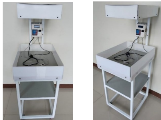
Fig. 3. Infant warmer

from static electricity from the infant warmer. This tool with IoT technology can increase the accuracy of temperature monitoring, increase security, and enable remote monitoring. The infant warmer can be seen in Fig. 3.