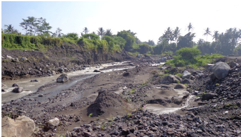
Figure 2. Agricultural land damaged by the brunt of lava and eroded by lava flows after the 2010 Merapi eruption. The agricultural land can't be planted again because it is now become part of the river.

trim. Cold lava is of course due to water-borne, so that the contents of useful elements for the plant are unwashed. So, it is necessary to understand the typology of the agricultural land, its boundaries and the characteristics of rehabilitation.